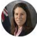
Rosemary Gauci , Minister-Counsellor Defence Materiel, Embassy of Australia, Washington, DC