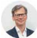
Moderator: Sander Oude Hengel , Defense Cooperation Attaché, Royal Netherlands Embassy, Washington, DC